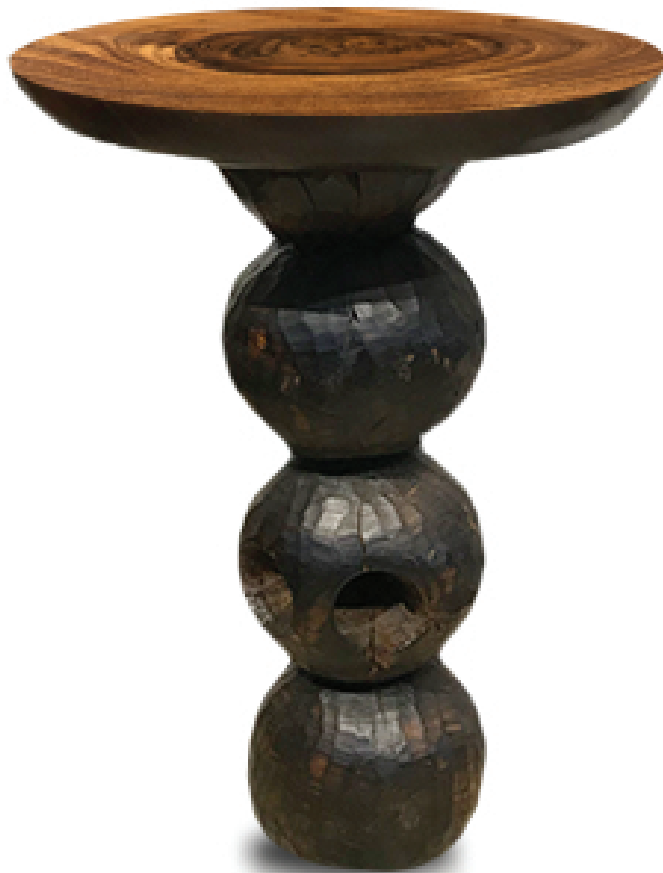
Snaka Waka Side Table Featured: Acacia with Ebonized Base